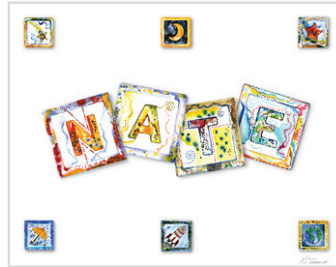
___ Into the Sky