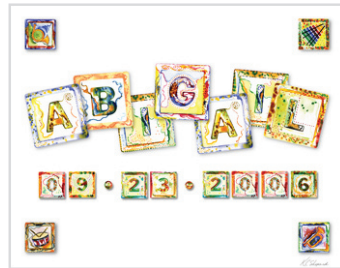
___ Music with Birthday