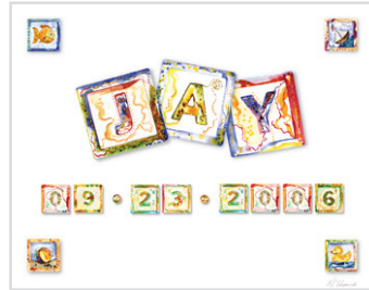
___ At the Beach with Birthday