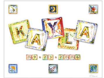
___ Into the Sky with Birthday