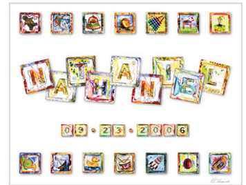
___ Toys & Things with Birthday