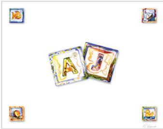
___ At the Beach