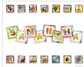
___ Toys & Things